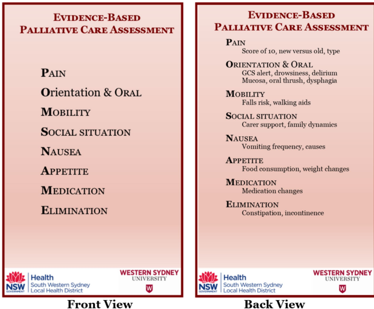
Fig. 1 POMSNAME Aide-Mémoire