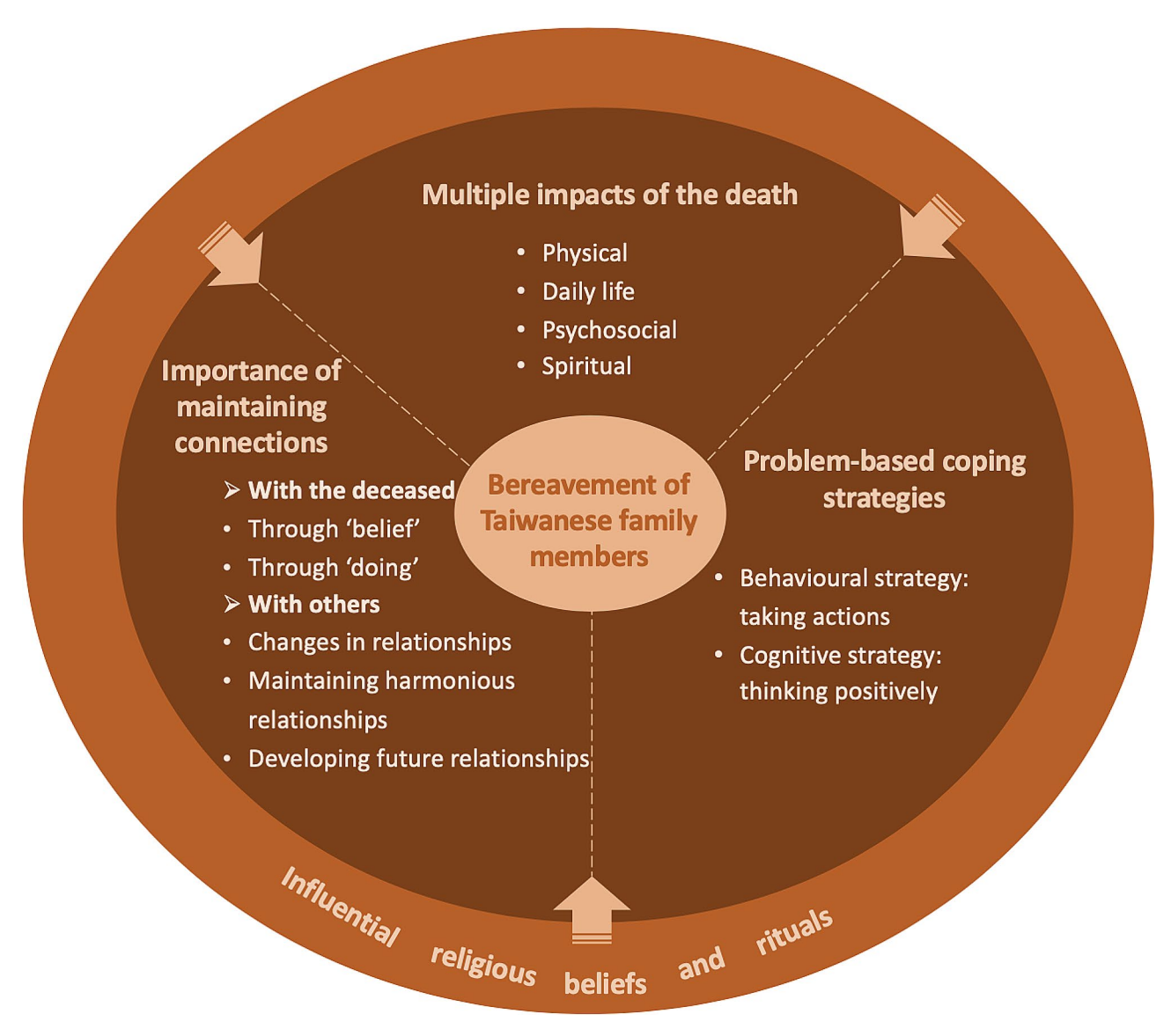
Fig. 2 Themes of the bereavement experience of Taiwanese family members

Liang et al. BMC Palliative Care (2024) 23:14 Page 9 of 15