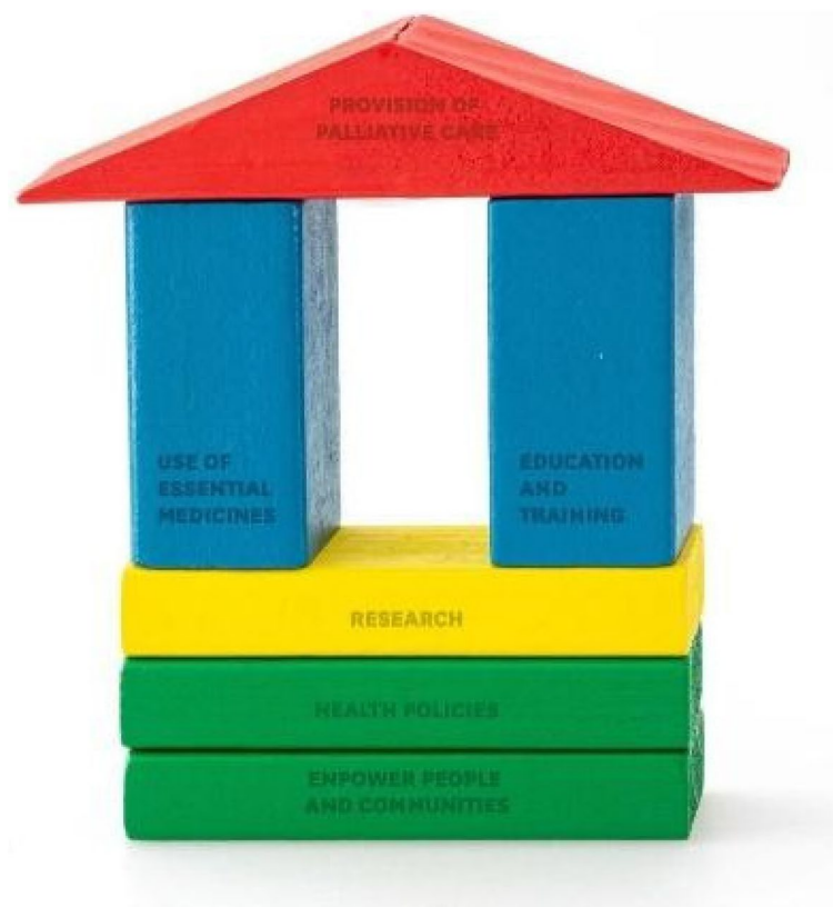
Fig. 2 WHO conceptual model

On the second day, in order to understand both the relevance and feasibility of the country, a shortened list of 13 stakeholders representative of the Ministry of Health, the World Health Organization, NGOs, the National NCDs Program, main clinics, and the National PC Association voted on the relevance (R) and feasibility (F) of the indicators. They were scored on a Likert scale of 1 to 5 (1=least, 5=most) using SurveyMonkey . Statistical measures such as the median, content validity index (capacity to evaluate the "development" construct) and disagreement index (dispersion measure to understand homogeneity of scores) were calculated. The content validity index was calculated following Lawshe et al. using the following formula: ((n \text{ voters with highest scores: } 4 \text{ and } 5) - (n \text{ total voters}/2)) / (n \text{ total voters} / 2) . The score ranges from 0 to 1 and should be interpreted as adequate if it is above 0.80. The Disagreement index (symmetry-adjusted inter-percentile rank) was calculated following Fitch et al. as the ratio between the