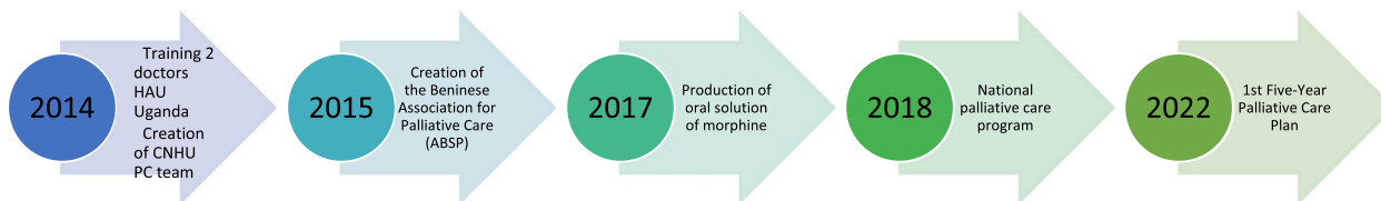
Fig. 1 Main milestones in the historical development of palliative care in Benin

The set of indicators contained in the WHO report served as a starting point from which a six-step process was contemplated: 1st ) meeting with Benin’s key stakeholders to explain, validate, and adapt the indicators to